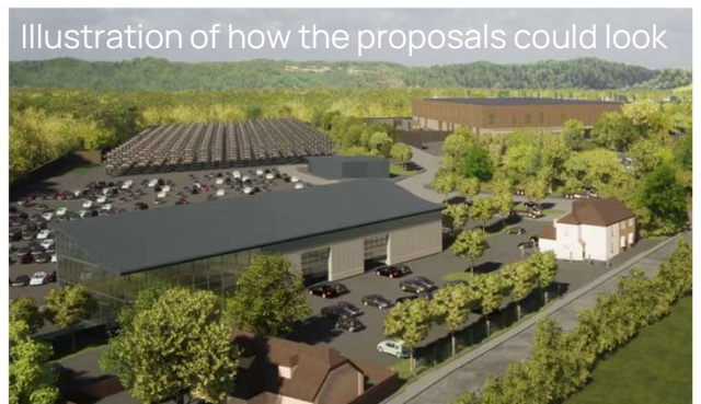
Illustration of how the proposals could look

Comments on the application must be submitted by 27 th September at: tinyurl.com/silverlakeplanning