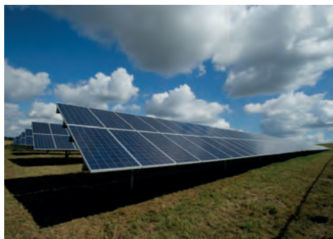
Solar energy arrays and solar farms are appearing around the country. WinACC (Winchester Action on Climate Change) says they can help solve the energy crisis.

Only a pitiful 16% of the electricity demand in the Winchester District is met by renewable energy generated from within the area.