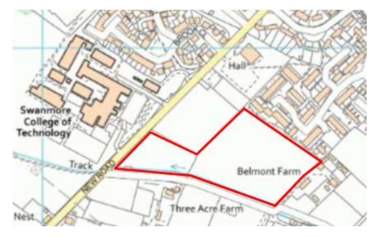
Site of the New Housing Development

Planning approval was passed despite concerns raised over road safety, parking and contraventions of the Swanmore Village Design statement.