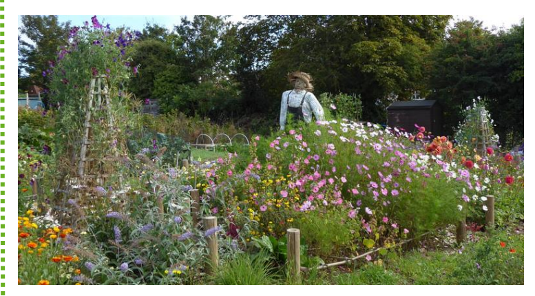
The Flower Pedlar in Droxford provides bouquets all grown from seed in the beautiful Meon Valley. Sown and grown, not flown!

Malcolm says: "Buying locally produced goods in local shops helps to reduce your carbon footprint, as these products do not come with thousands of air miles attached. Food from a local farm, for example, has not been carried on long plane or truck journeys to make it to your plate, meaning you can dig in with a less guilty conscience."