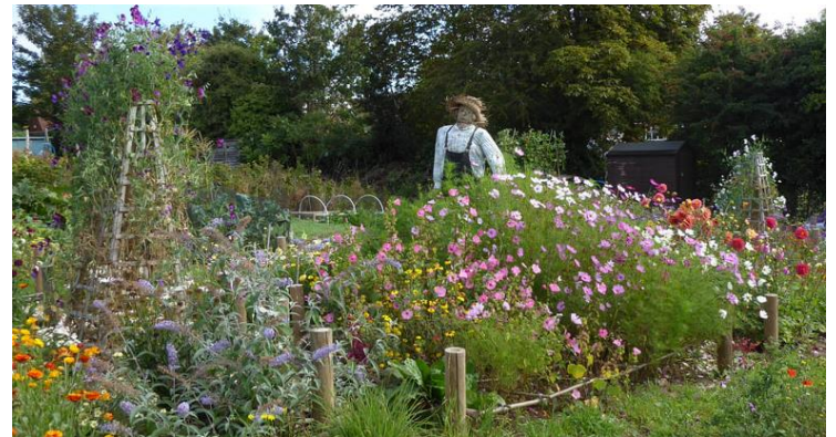
The Flower Pedlar in Droxford provides bouquets all grown from seed in the beautiful Meon Valley. Sown and grown, not flown!

Malcolm says: “Buying locally produced goods in local shops helps to reduce your carbon footprint, as these products do not come with thousands of air miles attached. Food from a local farm, for example, has not been carried on long plane or truck journeys to make it to your plate, meaning you can dig in with a less guilty conscience.”