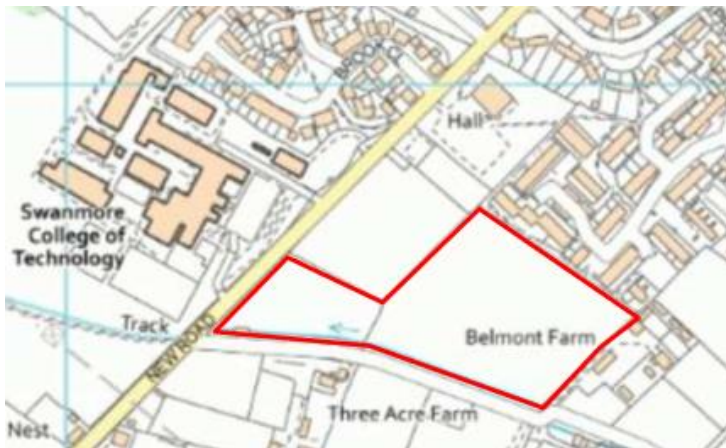
Site of the New Housing Development

Planning approval was passed despite concerns raised over road safety, parking and contraventions of the Swanmore Village Design statement.