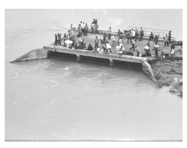
Mozambique 2019

But the biggest danger lies with those who accept the science but continue to behave irrationally out of habit (just one more cigarette) or for more cynical short-term political advantage. Our government fully accepts the IPCC findings; it is signed up to the Paris Agreement. Yet Mrs May's government, in all its actions seems committed to breaking that Agreement