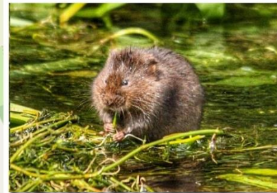
Malcolm says "Did you know – Water Voles were extinct in our area in 2008, but have now returned to 30 locations along the River Meon".