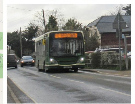
Malcolm continues pressing the Council for improvements to local bus services.