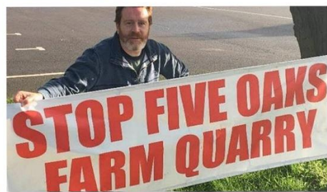
Malcolm supports the on-going campaign to stop Five Oaks Farm Quarry, this quarry is not needed and not wanted – this saga must be stopped.